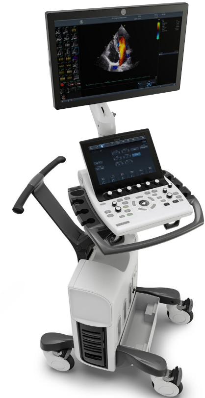
Vivid™ S60N & Vivid S70N Ultra Edition* Ultrasound